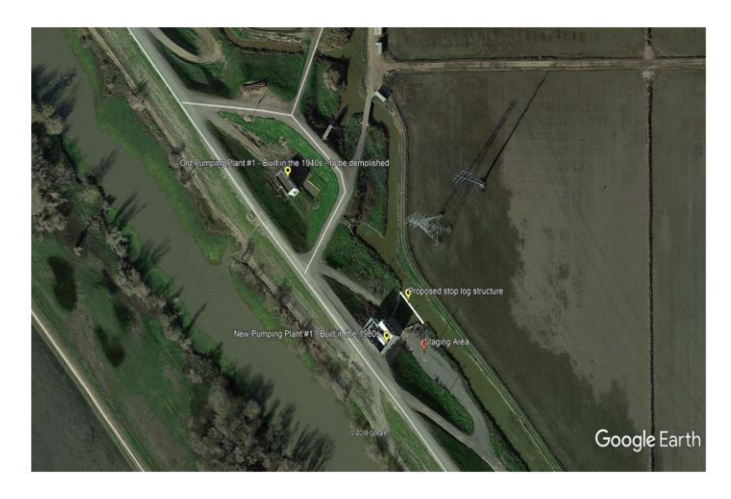
3) Approximate project footprint map (Pumping Plant 1)